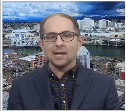
TUCKER CARLSON UNCENSORED